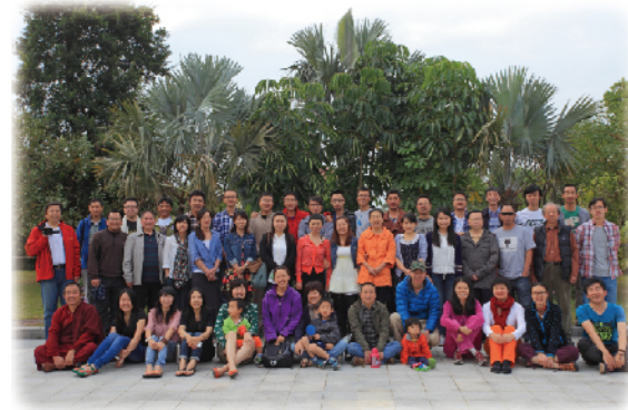
Shan Shui Conservation Center at 2013 Annual Retreat in Dali